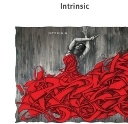
Columbia Valley Cabernet Sauvignon