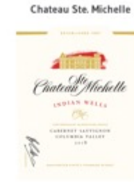
Indian Wells Cabernet Sauvignon