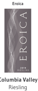
Columbia Valley Riesling